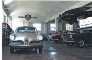
Scuderia Azzurra Workshop