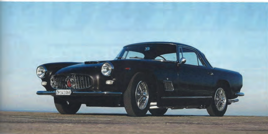
Maserati 3500 GTi Touring