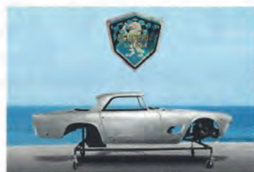
Maserati 3500 GT